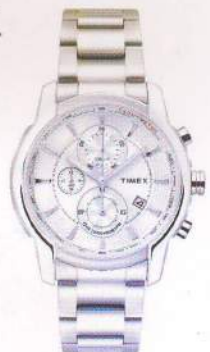
TW000Y500 M.R.P. 5495.00 Steel case - Steel Bracelet