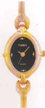
LK01 M.R.P. 1765.00 Gold Category - Half Kada Half Bracelet