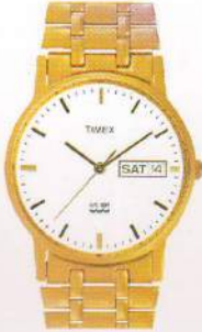
A506 M.R.P. 1195.00 Gold Category - Bracelet with Day-Date