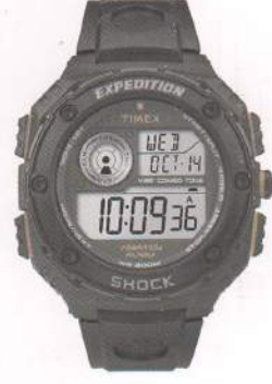
T49982 M.R.P. 5995.00 Expedition Vibe Shock Resin case - Resin Strap