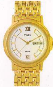
BR03 M.R.P. 1545.00 Gold Category - Bracelet with Day-Date