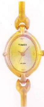
LK02 M.R.P. 1765.00 Gold Category - Half Kada Half Bracelet