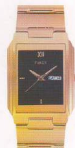
WT07 M.R.P. 2495.00 Gold Category - Bracelet with Day-Date