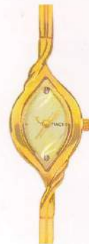
JJ00 M.R.P. 2895.00 Gold Category - Full Kada