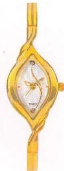
JJ01 M.R.P. 2895.00 Gold Category - Full Kada