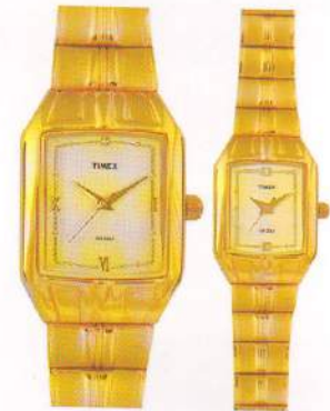
PR59 M.R.P. 895.00 Gold Category - Bracelet