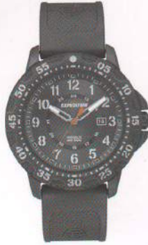
T49994 M.R.P. 2995.00 Expedition Rugged Resin Resin case - Resin Strap