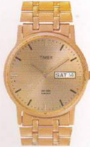
A508 M.R.P. 1195.00 Gold Category - Bracelet with Day-Date