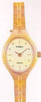
TU00 M.R.P. 2145.00 Gold Category - Shimmering Bracelet