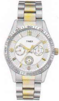
T1000W20300 M.R.P. 3495.00 Two Tone (Gold + Steel)