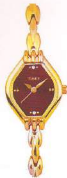
L901 M.R.P. 2095.00 Gold Category - Bracelet