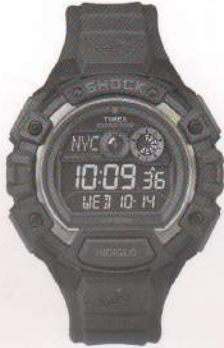
T49970 M.R.P. 5495.00 Expedition Global Shock Resin case - Resin Strap