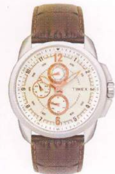
TI000N90400 M.R.P. 3995.00 Steel case - Steel Bracelet