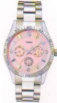
T1000W20200 M.R.P. 3295.00 Steel case - Steel Bracelet