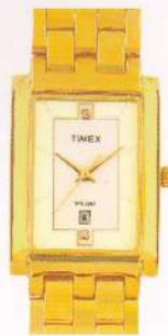
BE14 M.R.P. 1745.00 Gold Category - Bracelet with Date