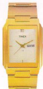
WT05 M.R.P. 2495.00 Gold Category - Bracelet with Day-Date