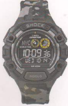
T49971 M.R.P. 5495.00 Expedition Global Shock Resin case - Resin Strap