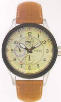
TI000I70700 M.R.P. 3295.00