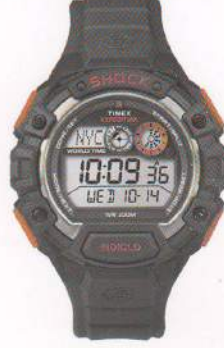
T49973 M.R.P. 5495.00 Expedition Global Shock Resin case - Resin Strap