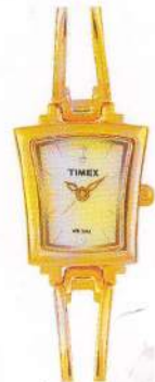
SJ01 M.R.P. 2195.00 Gold Category - Half Kada Half Bracelet