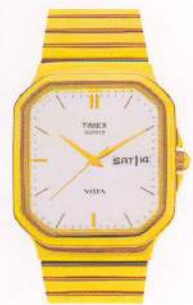
WD01 M.R.P. 1595.00 Gold Category - Bracelet with Day-Date