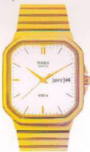
WD03 M.R.P. 1595.00 Gold Category - Bracelet with Day-Date