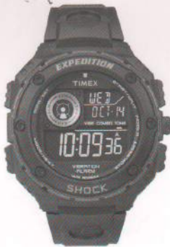
T49983 M.R.P. 5995.00 Expedition Vibe Shock Resin case - Resin Strap