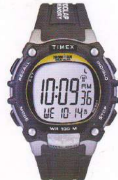
NA33 M.R.P. 2945.00