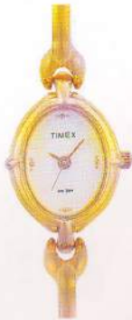
LK00 M.R.P. 1765.00 Gold Category - Half Kada Half Bracelet