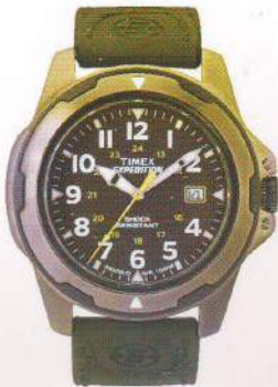
T49271 M.R.P. 4145.00