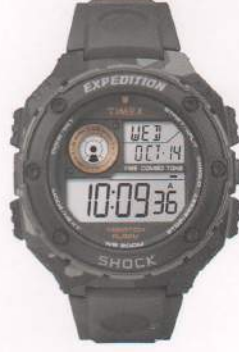
T49981 M.R.P. 5995.00 Expedition Vibe Shock Resin case - Resin Strap