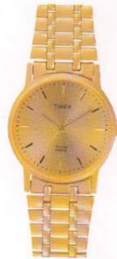
B305 M.R.P. 895.00 Gold Category - Bracelet