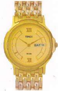
BR04 M.R.P. 1545.00 Gold Category - Bracelet with Day-Date