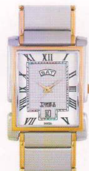
NL08 M.R.P. 2995.00 Two Tone (Gold + Steel) - Bracelet with Day-Date