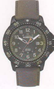
T49996 M.R.P. 2995.00 Expedition Rugged Resin Resin case - Leather Strap