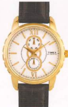
E300 M.R.P. 3545.00 Gold Category - Leather Strap