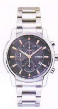
TW000Y502 M.R.P. 5495.00 Steel case - Steel Bracelet