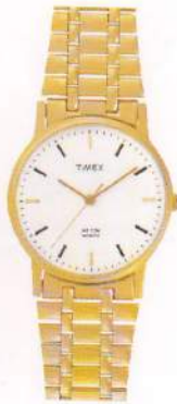
B303 M.R.P. 895.00 Gold Category - Bracelet