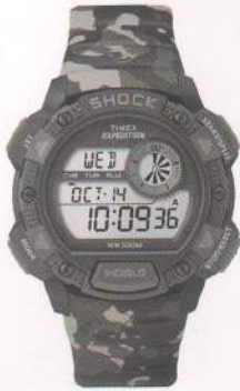
T49976 M.R.P. 4995.00 Expedition Base Shock Resin case - Resin Strap