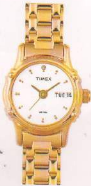
B809 M.R.P. 1345.00 Gold Category - Bracelet with Day-Date