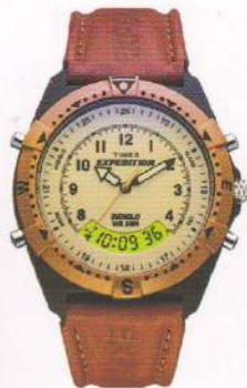
MF13 M.R.P. 3495.00