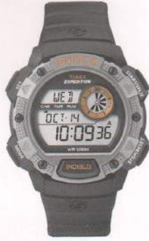
T49978 M.R.P. 4995.00 Expedition Base Shock Resin case - Resin Strap