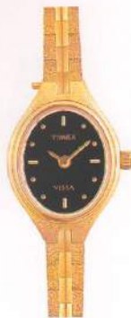
TU01 M.R.P. 2145.00 Gold Category - Shimmering Bracelet