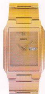
WT06 M.R.P. 2495.00 Gold Category - Bracelet with Day-Date