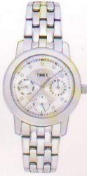
T1000W10000 M.R.P. 2995.00 Steel case - Steel Bracelet