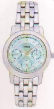
T1000W10200 M.R.P. 2995.00 Steel case - Steel Bracelet