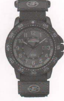
T49997 M.R.P. 2995.00 Expedition Rugged Resin Resin case - Fast Wrap Strap