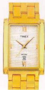
BE15 M.R.P. 1745.00 Gold Category - Bracelet with Date