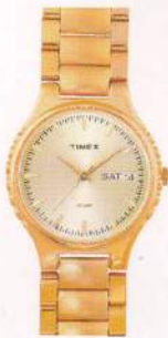
C902 M.R.P. 1445.00 Gold Category - Bracelet with Day-Date